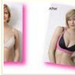
3 Days Left in Lingerie Contest