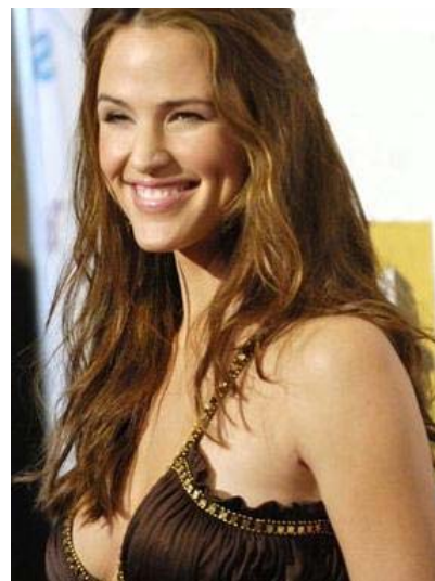
Celebrating Her Inner Eve