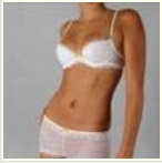
PRICELESS PANTY CONTEST