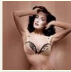
SCIENCE OF SEXY LINGERIE CONTEST